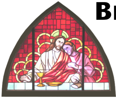
PALM SUNDAY OF THE LORD'S PASSION