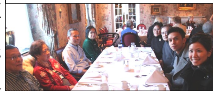
Another table of Council well-wishers