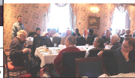
The birthday celebrant with Well-wishers at Hotel Sask