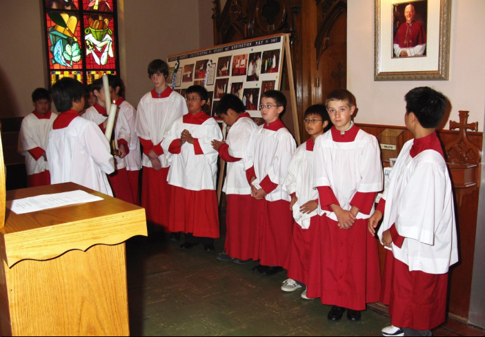
Young Sacristans ready for start of Mass