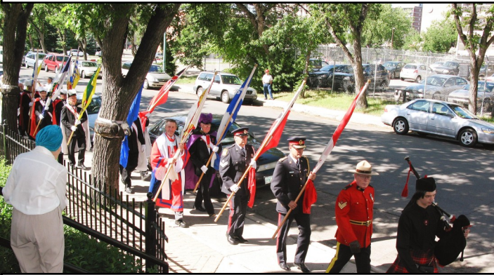
Color guards marching towards Blessed Sacrament