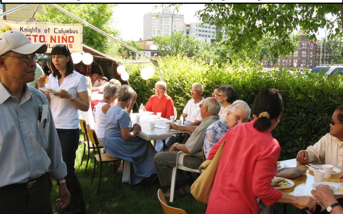
Canada Day Crowd at the Council Pancake Brunch