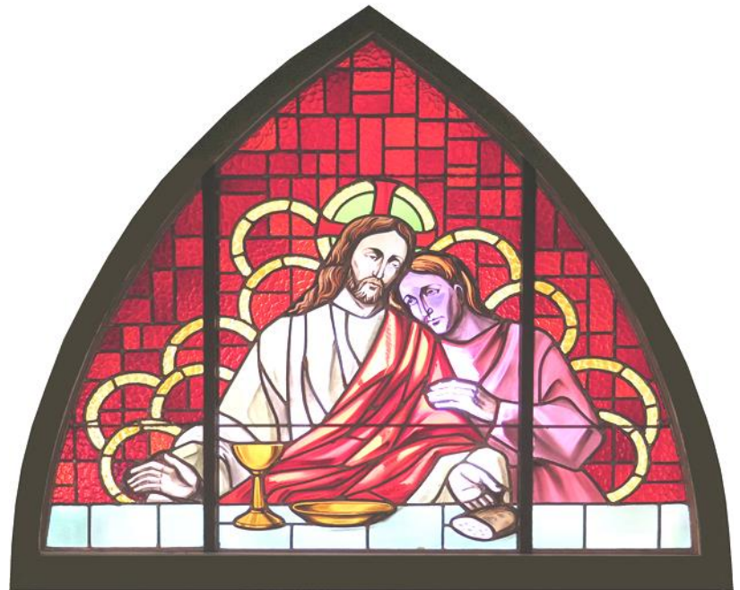
Jesus and the Beloved disciple at the Last Supper