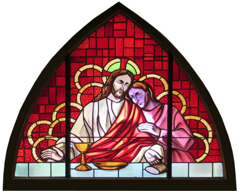
Jesus and the Beloved disciple at the Last Supper