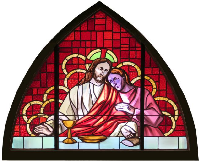
Jesus and the Beloved disciple at the Last Supper