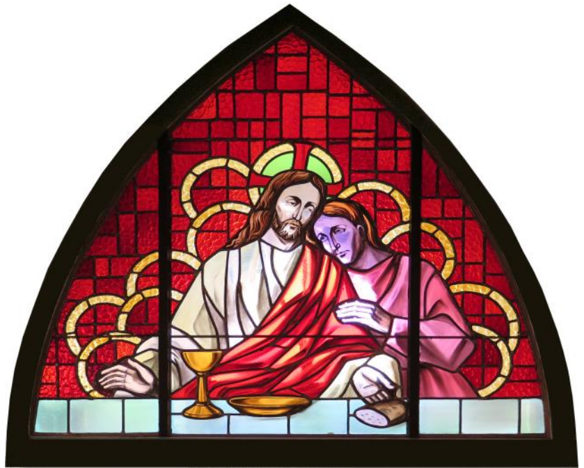
Jesus and the Beloved disciple at the Last Supper