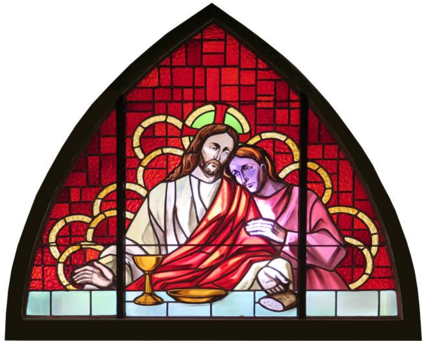
Jesus and the Beloved disciple at the Last Supper