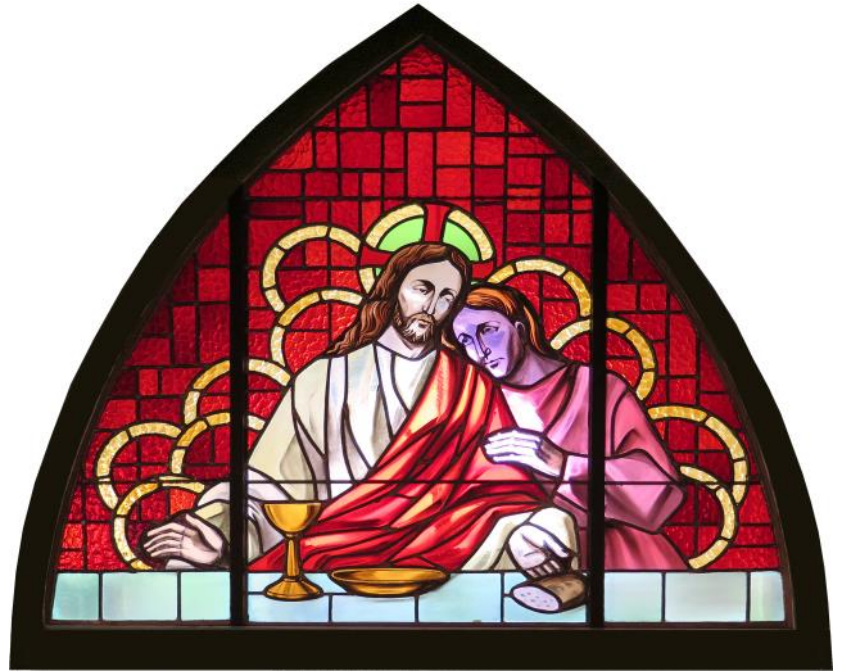
Jesus and the Beloved disciple at the Last Supper