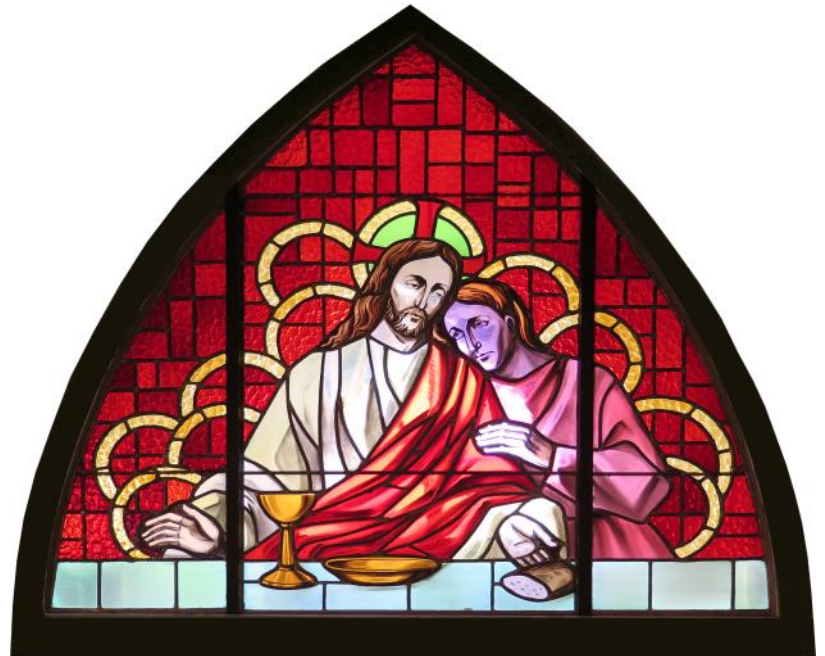
Jesus and the Beloved disciple at the Last Supper