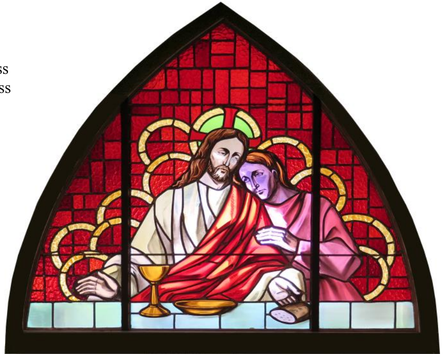
Jesus and the Beloved disciple at the Last Supper