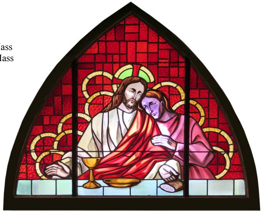
Jesus and the Beloved disciple at the Last Supper