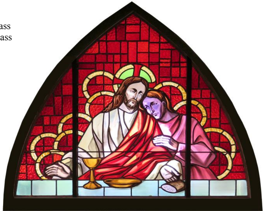
Jesus and the Beloved disciple at the Last Supper