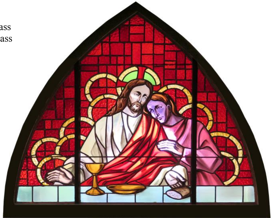
Jesus and the Beloved disciple at the Last Supper