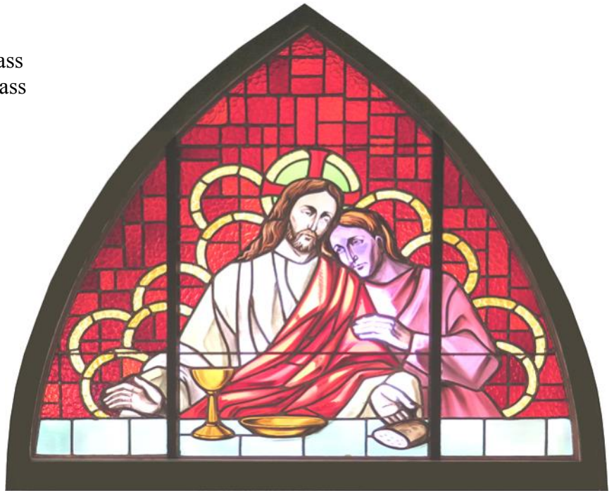
Jesus and the Beloved disciple at the Last Supper