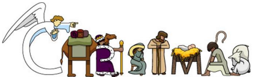
CHRISTMAS IS THE CELEBRATION OF THE BIRTH OF JESUS, THE SAVIOUR OF MANKIND