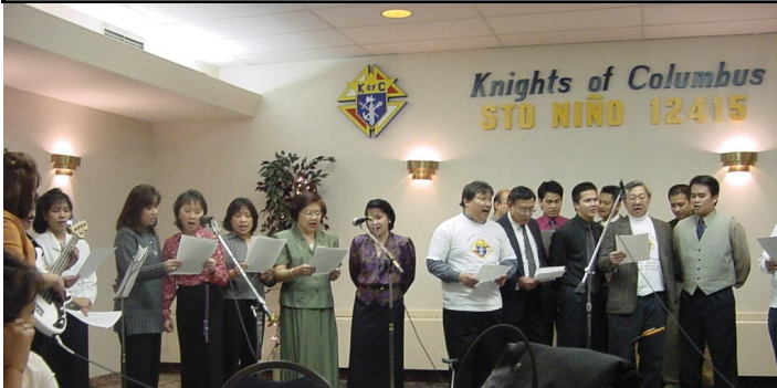
The Santo Nino Singers did Philippine songs, "Mahiwaga" and "Hindi Kita Malilimutan" and a hit "I'm going Out of My Head" at our Third Anniversary celebrated on April 7, 2002.