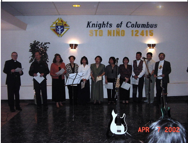
Recipients of Certificates of Appreciation from Council