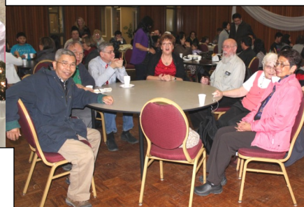
Parishioners at the Parish Hall after the Simbang Gabi