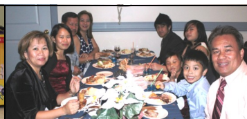
The Felicianos and Inocallas At the Council Christmas party