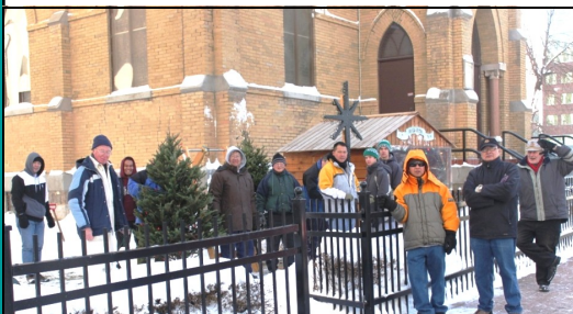
The men at the Nativity Scene they set up