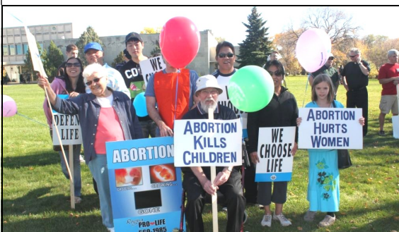
Santo Nino Council Knights at the Pro-Life Chain