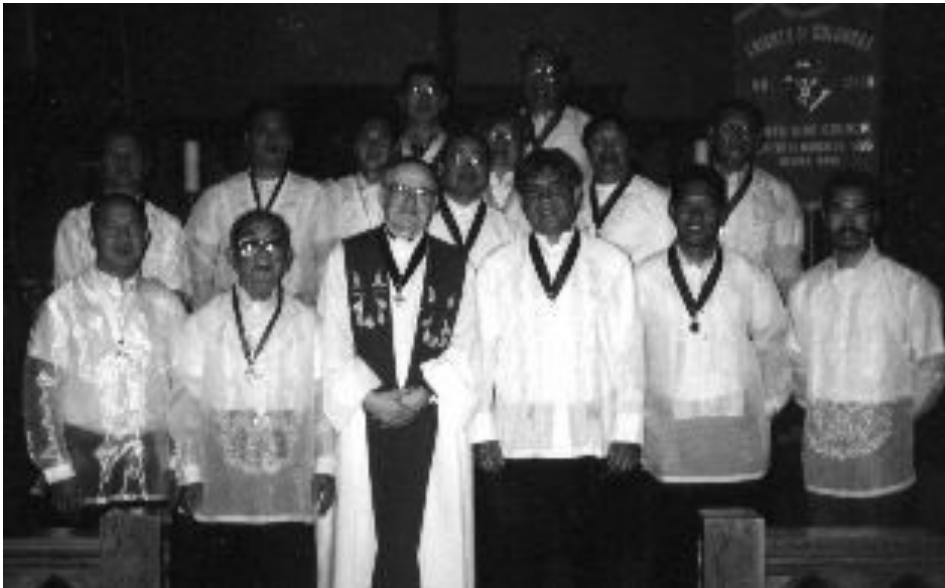
The new officers for the Columbian Year 2001-2002