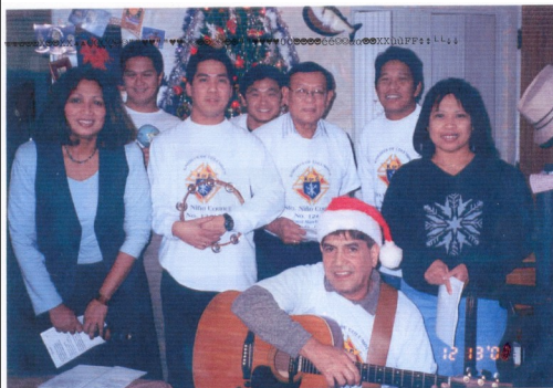
Some carolers at a member's home